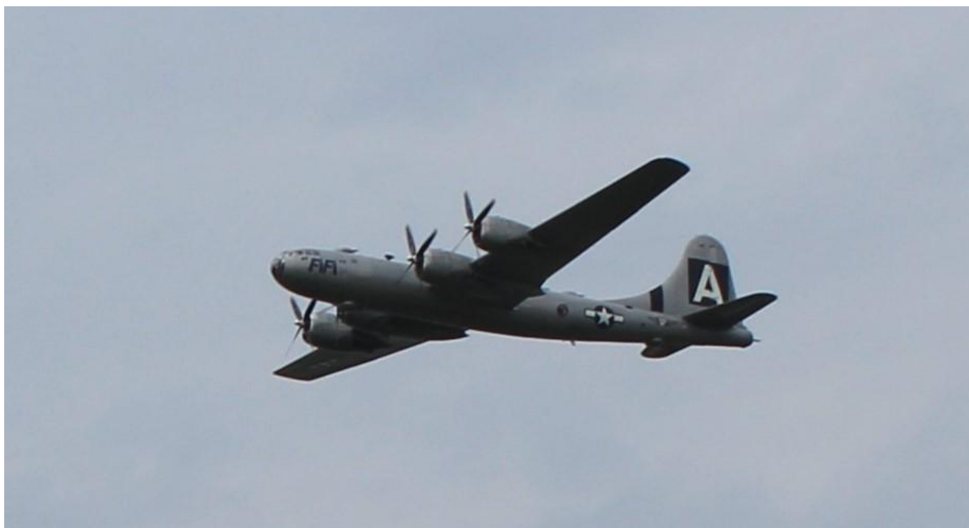
Thunder over Michigan Airshow