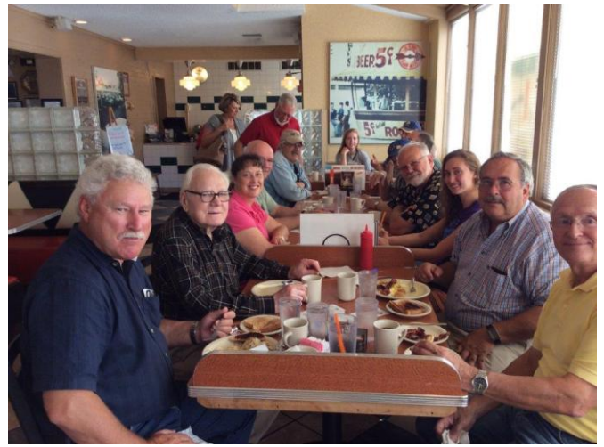
A recent Friday in August had over fifteen of us at the local A&W for coffee !!

liked to have spent more time at car shows and the like. I think that kind of venue is good pickin's for the kind of people we'd like to attract to our ranks. When I think about the things we have done to promote aviation, I think back to our successes in bringing more people to our club and more important, people into flying itself. This point is emphasized with the quality of those whom have joined us. In Adult Eagles it's not always about the numbers. I am proud of the sincerity of our group. I know somewhere we have touched someone in a way to a point they will be back. Perhaps it was a question about a plane that anyone of us could have answered. That's what's great about Chapter 55, we're all about aviation. I'd like to thank those volunteers of Adult Eagles. Everyone. From the pilots to the people who give me perspective pilot names. Please keep them coming. I'll see you out flying!